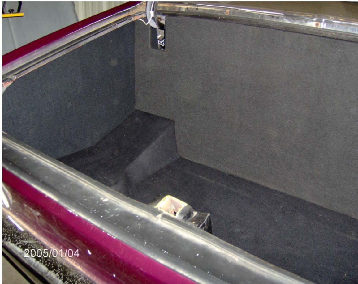
Finished Nova trunk left side. Note that the material applied to the metal floor goes under the floor panel and under the hinge and side panels.